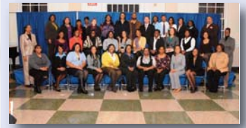
College of Education PENning Ceremony